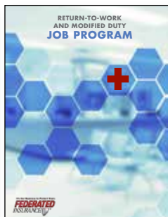
Return-to-Work and Modified Duty Program