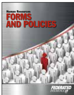
HR Forms and Policies