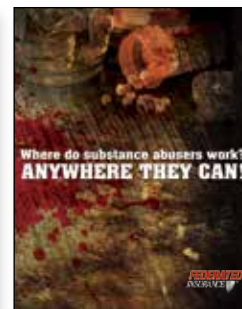
Drug- and Alcohol-Free Workplace Program

Yes! I would like to receive complimentary risk management materials from Federated Insurance.